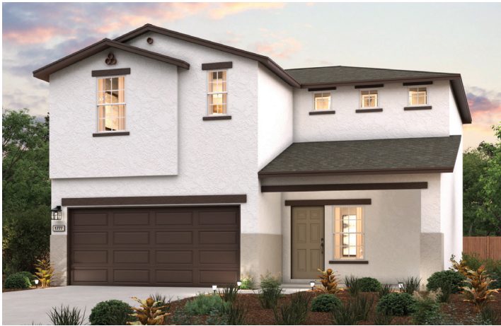
ELEVATION A - EARLY CALIFORNIA

APPROX. 1,777 SQ. FT. | 2-STORY | 3 BEDROOMS | 2.5 BATHROOMS | 2-BAY GARAGE