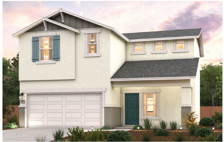
ELEVATION B - BUNGALOW