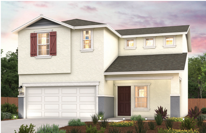
ELEVATION C - COTTAGE