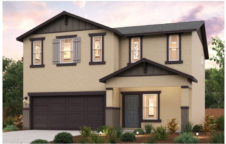
ELEVATION B - BUNGALOW