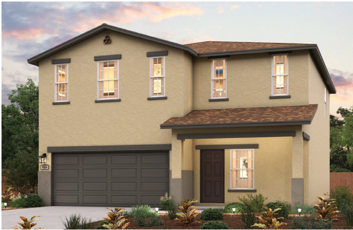
ELEVATION A - EARLY CALIFORNIA

APPROX. 1,924 SQ. FT. | 2-STORY | 4 BEDROOMS | 2.5 BATHROOMS | 2-BAY GARAGE