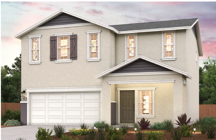
ELEVATION C - COTTAGE