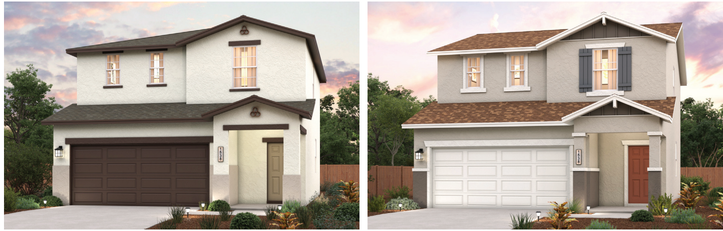
ELEVATION A - EARLY CALIFORNIA

APPROX. 1,538 SQ. FT. | 2-STORY | 3 BEDROOMS | 2.5 BATHROOMS | 2-BAY GARAGE